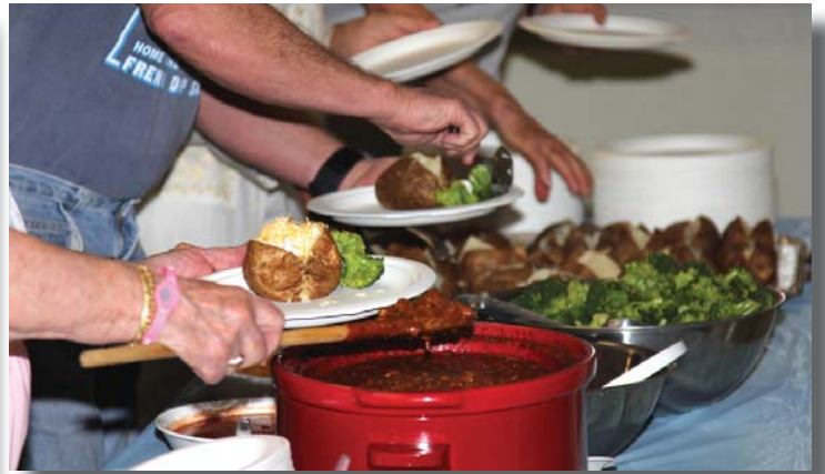
mmmmmm looks delicious