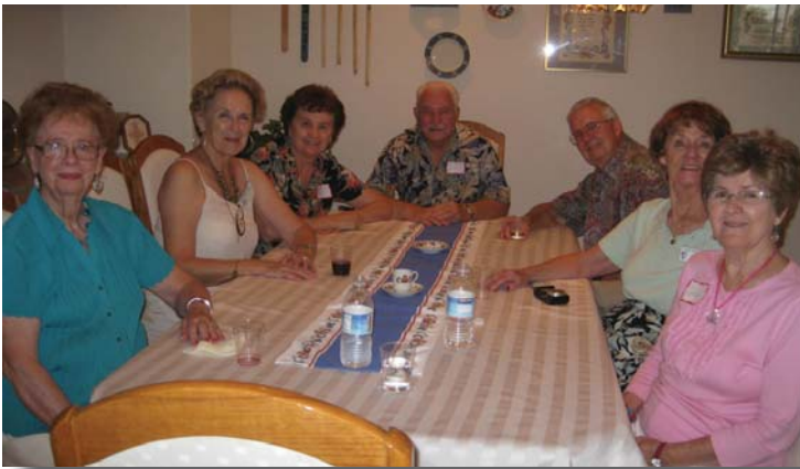
ready for food