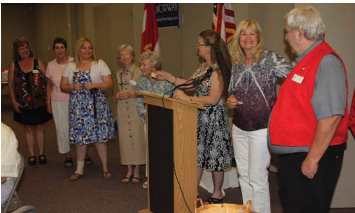
Cultural Skills Pin recipients at September Social

If you are interested in joined a group from the Sons of Norway in a reading circle, we will be meeting at 3PM on October 15 in the Social Hall. We will be working on the Cultural Skills Program for Literature. If you are interested or would like more information please email or call me at vlsimon@jhu.edu or 760-203-0279.