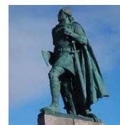
Leif Erikson Day , October 9, honors the first European known to have set foot in North America.