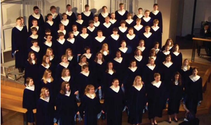
: Luther College Nordic Choir performing at Hope Lutheran Church

I am looking forward to receiving information for the newsletter.